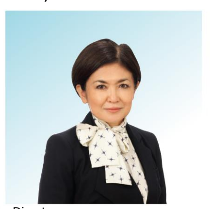
Orrector ( Audit & Supervisory Committee Member)