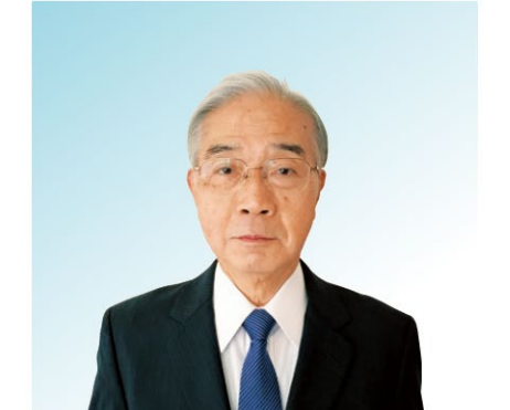
Oirector ( Audit & Supervisory Committee Member)